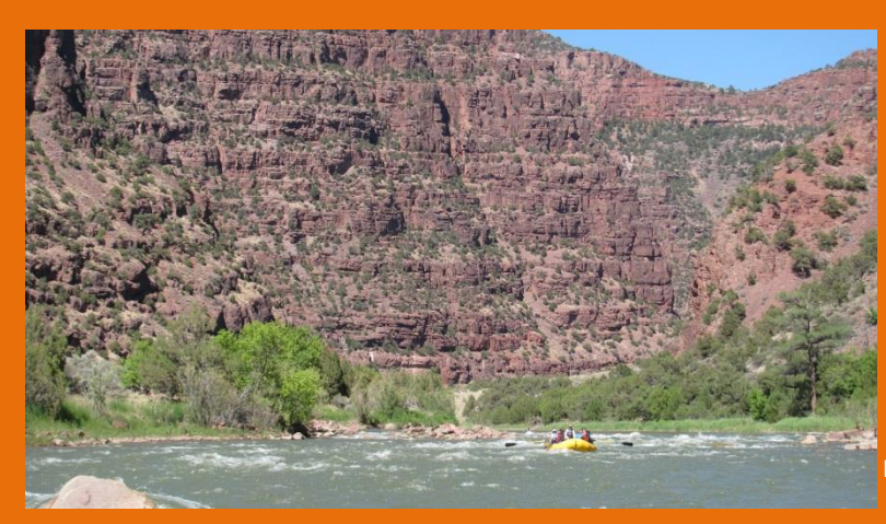
The Gates of Lodore on the Green River