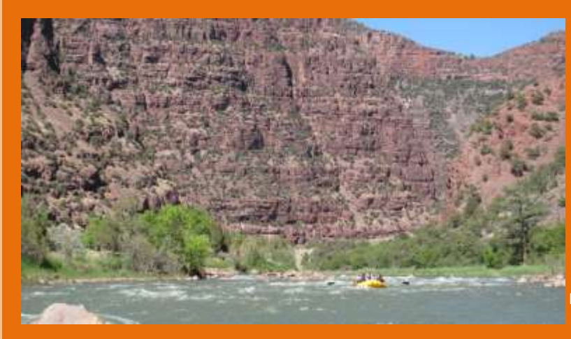
The Gates of Lodore on the Green River