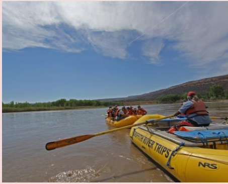
Oarboats are the boat of choice on this river trip.