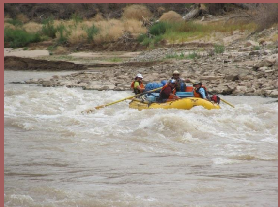
Our amazing guides have trained many hours to be able to safely maneuver through the rapids of Cataract Canyon on the Colorado River.

There is no electrical power in the camps along the rivers. It is suggested that you carry a supply of additional batteries for your camera and any battery-operated appliances you are taking along. Mechanical or electronic devices that are noisy and which may disturb other guests "wilderness experience" are discouraged. NO drones are allowed on our trips.